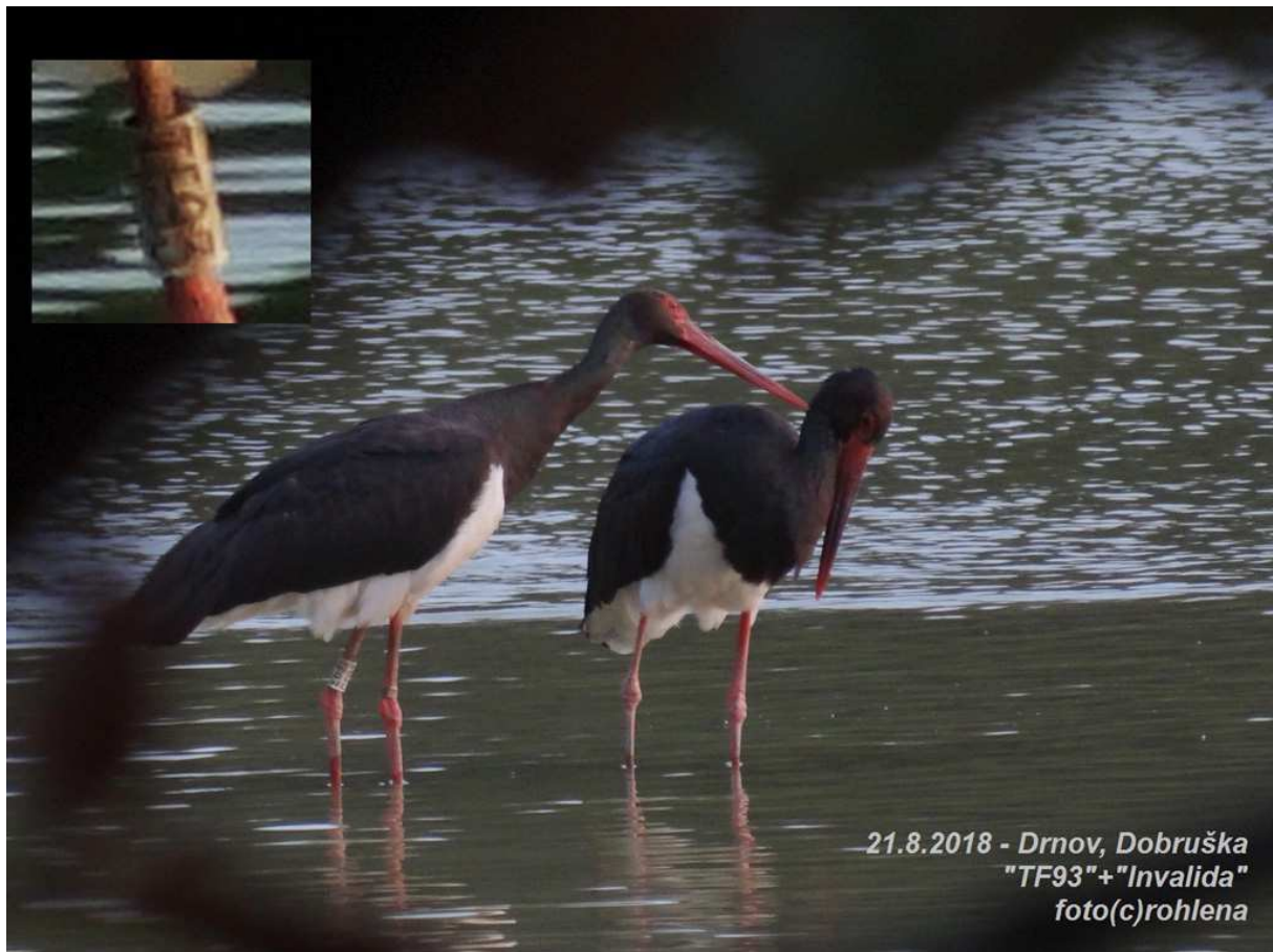
21-08-2018, pond Drnov, Dobruška (RK)