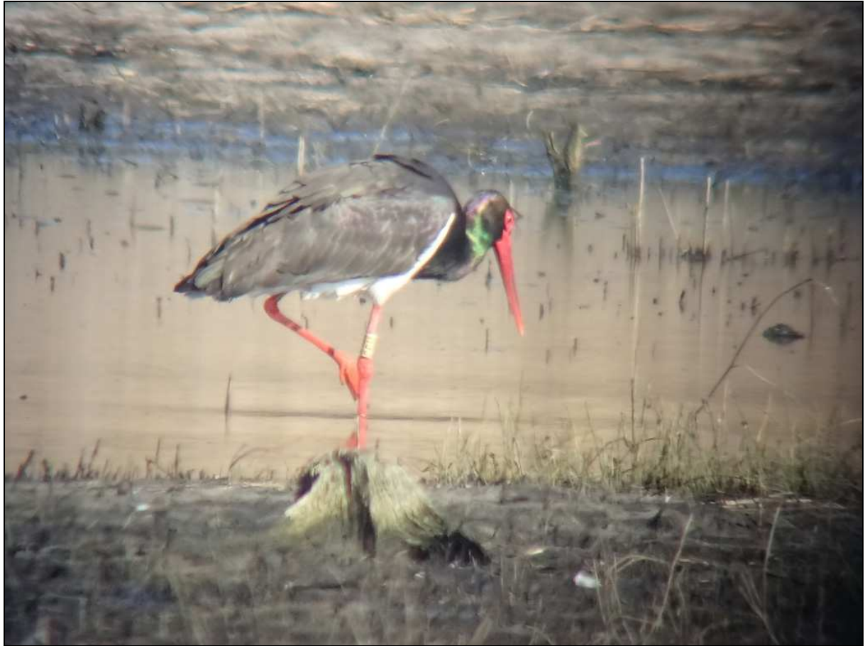
30-03-2018, Břehy (PU)